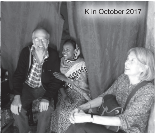
K in October 2017